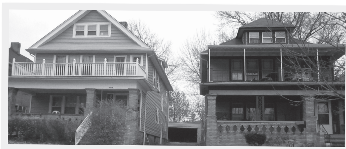
At top: 3122 and 3126 Kensington Rd. advertised for sale in the Cleveland Plain Dealer of February 17, 1924.