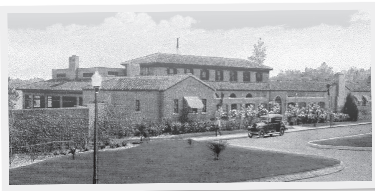
Cover image (current) and at left (c. 1926): The Cleveland Heights Country Club in Lakeland, FL.