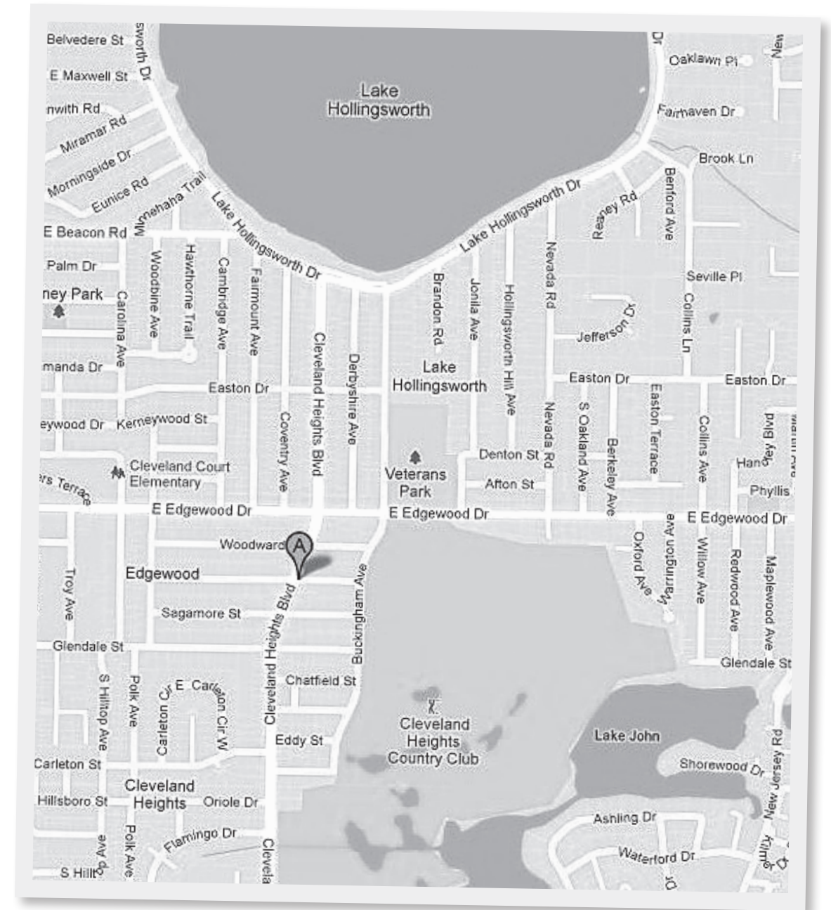
Above: A map of the Cleveland Heights development in Lakeland, Florida.