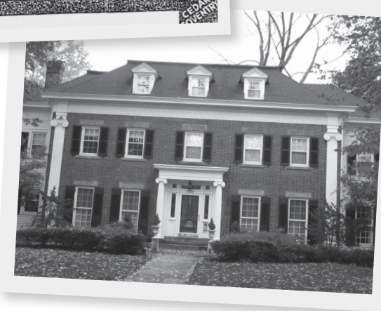
Above top: A 1916 advertisement for the “lower” Cedar-Coventry allotment.